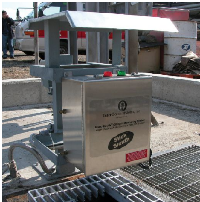
Typical installation of oil spill monitor on an industrial sewer.

The majority of sensors installed to date are used to monitor storm water and cooling water discharge in industrial sewers, sumps, separators, settling ponds, and outfalls. When an