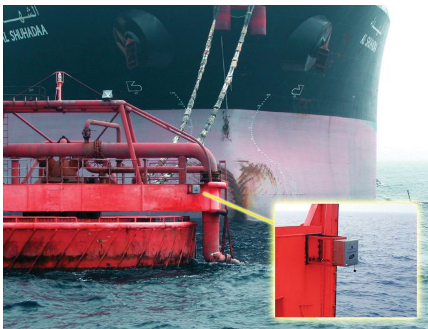
Real-time spill monitoring on an offshore buoy.

level. This discharge valve is either left open all of the time or kept in a normally closed position and then must be manually opened when rainwater begins to accumulate on the roof. The risk in the “valve normally closed scenario” is that human intervention is required (to open tank roof valves while it is storming)—and if too much water accumulates, the roof can sink—a worst case scenario. In fact, a number of sunken roofs have been reported recently in the wake of Hurricane Harvey.